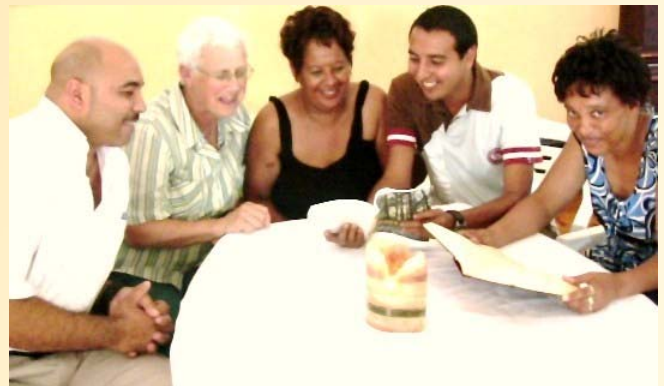
A Parish Core Community at Training Workshop

"I received an invitation from the parish priest to serve on the Core Community for my parish and so I participated in the October introductory workshops. As I left, I felt truly renewed spiritually through the prayer and faith sharing. The following day I received the news that my son had been killed. I couldn't believe it. I felt totally lost and wondered where God was in all this. It was the members of my Parish Core Community who gathered around to support me. I was able to draw on the spiritual experience of the workshop and I have come through this terrible experience. Now I know the real reason I was invited to join the Parish Core Community, and I can witness how God has led me."